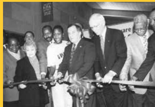
Grand Opening of the Homan Square Community Center Campus in December of 2001

Now is a great time to invite your friends to support the Foundation for Homan Square. The mission of providing housing, healthcare, recreational facilities, quality education, and a revitalized community has never been more relevant. Homan Square supporters know they are directly impacting solutions for overcoming the inequalities that leave many vulnerable and hurting. Together we can and do make a difference. Visit www.homansquare.org/support to find out how.